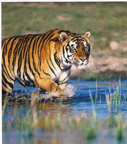
Top: A porch at Reni Pani with a seasonal stream flowing by. Above left: A tiger on the prowl. Above right: The king-sized bed occupies centre stage in a bedroom at Reni Pani

“Air-conditioned cottages, a pool and spa—Reni Pani is everything you don't expect in the middle of the jungle”