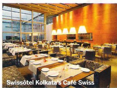
Swissôtel Kolkata's Café Swiss

A half-hour's drive from major auto-makers like Volkswagen, the Marriott Courtyard is a convenient hotel for